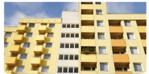
Every apartment has a balcony.