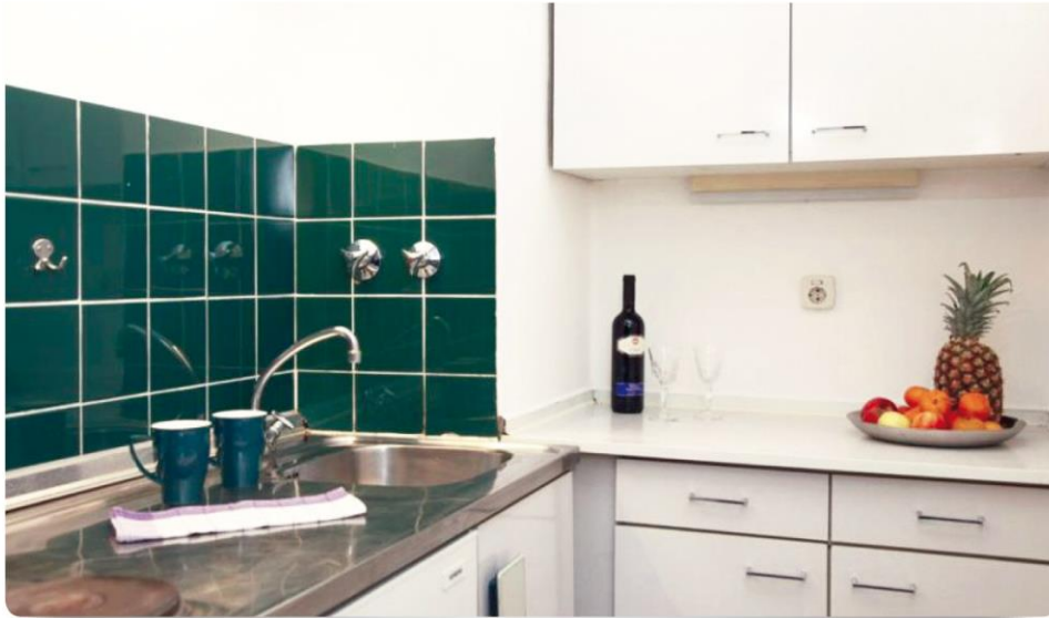
Practical and fully furnished.

1 room apartments in the apartment house, Spandau Berlin